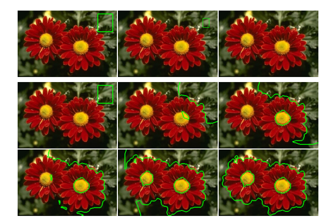
Figure 1. (1st row) Segmentation result using conventional level set; (2nd row and continuing on 3rd row) Results using proposed method.

Instead of solving the PDE problem in (3) using FDM with the upwind scheme, we interpolate the level set function \Phi(\mathbf{x}) using a number of RBFs and evolve it by adapting the expansion coefficients. The RBF interpolation is expressed as: \Phi(\mathbf{x}) = p(\mathbf{x}) + \sum_{i=1}^N \alpha_i \psi_i(\mathbf{x}) , where \psi_i denote a RBF function, N denotes the number of RBFs, p(\mathbf{x}) is a first-degree polynomial p(\mathbf{x}) = p_0 + p_1 x + p_2 y , and \alpha_i are the expansion coefficients. Assuming time and space are separable, the time dependence of the level set function is now due to the RBF interpolation, whose evolution is achieved by solving the following ODE: